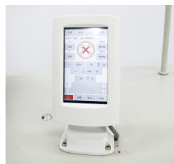
触摸屏操作面板 Touch screen